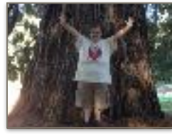
STRENGTH FOR THE JOURNEY PAGE 3