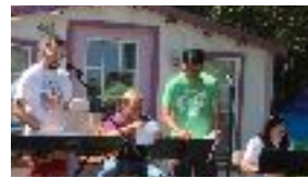
RETREAT RECAP PAGE 4