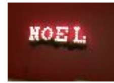
CHRISTMAS NEWSLETTER IN NOVEMBER