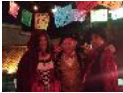
FIESTA DE LOS MUERTOS PAGE 2